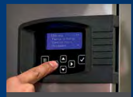
Full access bezel cover for easy access in non-public locations included with every machine