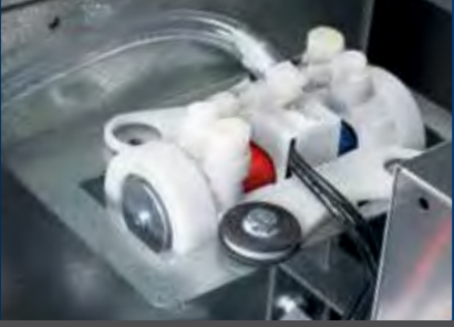
Patented Air Assist Harvest technology