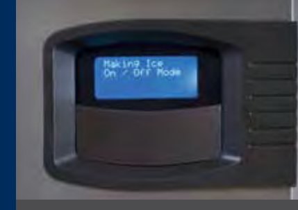
Standard button-cover bezel prevents unauthorized menu navigation in public areas