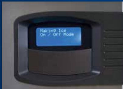
Standard button-cover bezel prevents unauthorized menu navigation in public areas