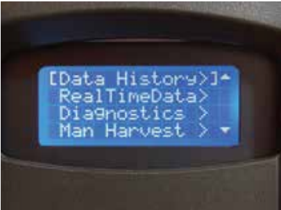
Service data display