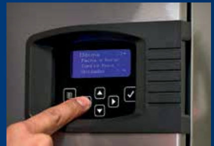
Full access bezel cover for easy access in non-public locations included with every machine