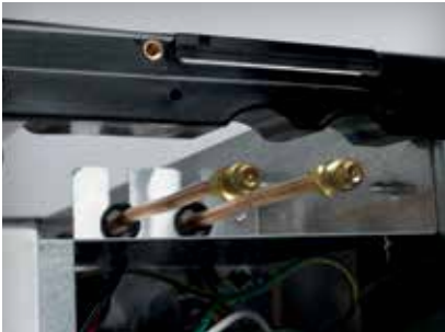
Easy frontal access to service ports