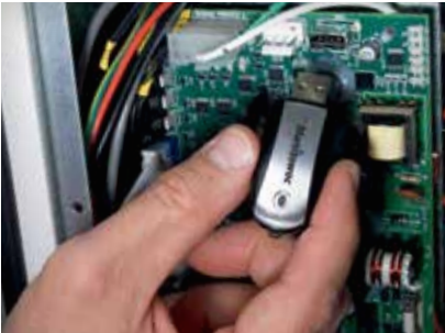
Firmware upgrades through USB port